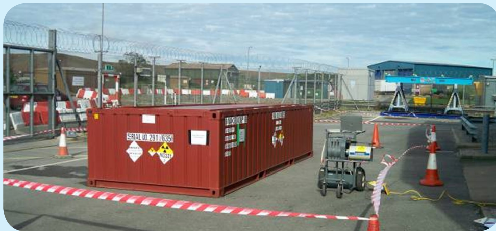
Onsite measurements were conducted between 2009 and 2012.

LLWR Ltd's key requirement is to verify that ISO containers meet the consignor's declared information. LLWR Ltd is developing the range of its services offered to clients. Its underlying objective is to ensure that waste is sentenced to the LLWR repository appropriately and to maximize utilization of the available space for storage of consignments.