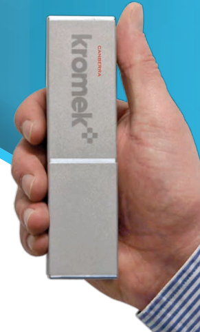
SIGMA integrated scintillator detector

The profile of the SIGMA detectors makes them ideal for many portable spectroscopy applications.