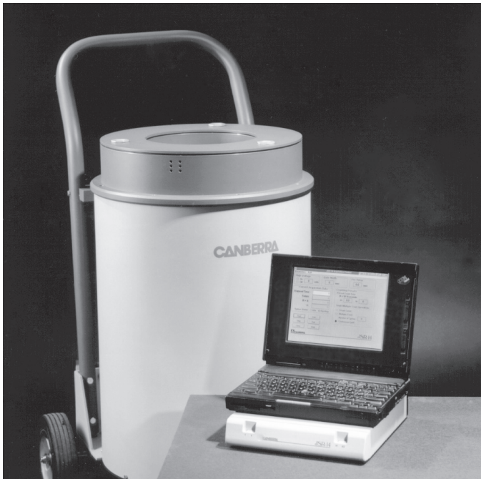
Small size and battery operation make the JSR-14 unit ideal for portable applications